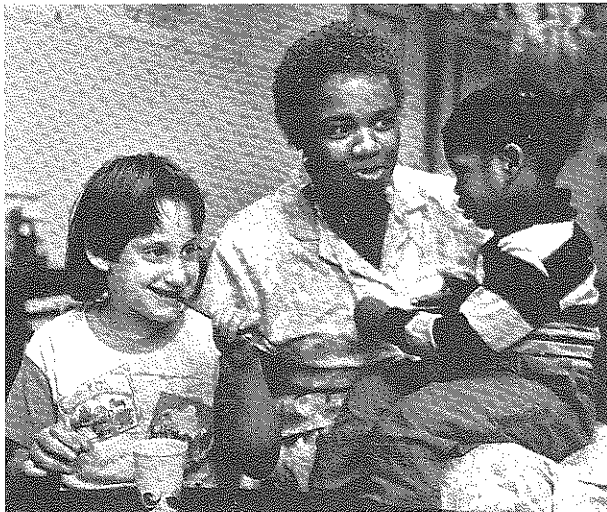
The Law Center helps parents of disabled children obtain day care services in setting with nonhandicapped children.

The Philadelphia Department of Human Services (DHS) has been criticized in a series of newspaper reports for mismanagement and neglect of its clients. Three situations directly affected our clients: