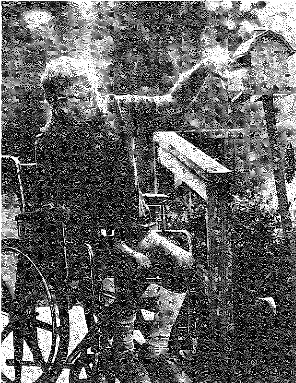
The Law Center represents both physically handicapped and mentally disabled persons in efforts to improve the quality of their lives.