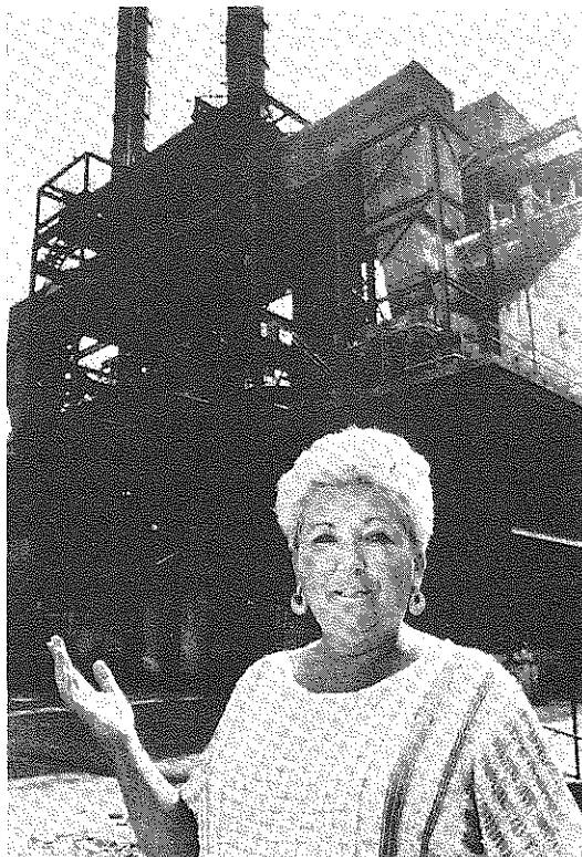
The Law Center represents community groups in Roxborough, Bridesburg and South Philadelphia seeking protection from noxious emissions caused by City trash and sewage treatment facilities and by chemical plants.

• Negotiations and litigation are under way on behalf of the Guardian Civic League to end the Police Department's use of rank order selection tests which discriminate against minorities.